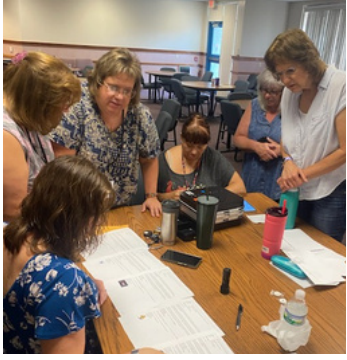
IUI Central Office staff enjoy team building exercises during their July Professional Development session