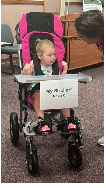
<u>Variety Pittsburgh</u> visited IU1 on July 14 and August 24 for fittings and presentations of their adaptive bikes. Above, the proud new owners go for a test ride

Join us for an unforgettable artistic experience at the upcoming Rural Arts Collaborative, taking place on Thursday, September 14, 2023, at the IU1 McMurray Campus located at 625 E. McMurray Rd. Canonsburg, PA 15317. In collaboration with Intermediate Unit 1 and Bricolage PGH, and proudly sponsored by the Fayette County Cultural Trust, EQT, Claude Worthington Benedum Foundation, and Oglebay Institute, this event promises to be a celebration of creativity and culture. From 11 am to 2 pm, immerse yourself in a diverse array of artwork, demonstrations, and workshops that will showcase the immense talent and innovation of artists from the rural community. Whether you're an art enthusiast or a curious learner, there will be something for everyone to enjoy and be inspired by. Mark your calendars and don't miss this opportunity to be part of a truly enriching and engaging arts extravaganza!